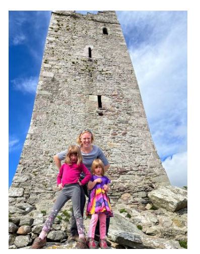
Making wishes at "the giant's ironing stone"